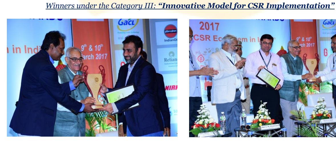
Large category: Arvind Ltd.