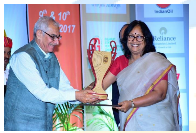
Large category: Deepak Nitrite Ltd.

Winners under the Category II: "Cohesive and Strategic Partnership"