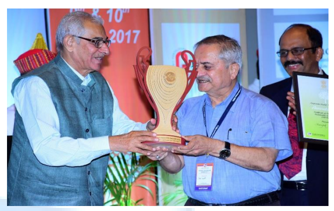
Small category: Transpek Industry Limited

Winners under the Category II: "Cohesive and Strategic Partnership"