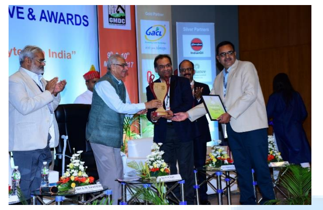
Large category: Gujarat Heavy Chemicals Limited

Winners under the Category I: "Sustainable & impactful CSR"