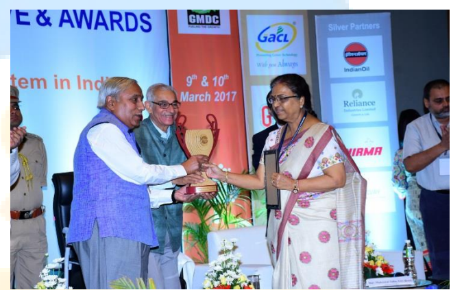
Small category: Gujarat Microwax Pvt. Ltd.